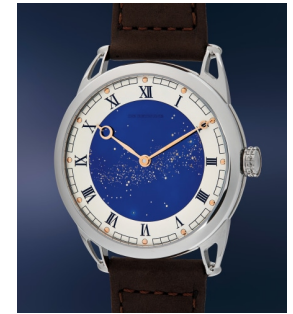
134 De Bethune An interesting and cutting-edge... Estimate $25,000 — 35,000