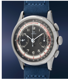
147 Omega An attractive, interesting, and r... Estimate $10,000 — 20,000