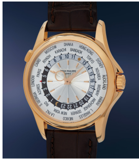
155 Patek Philippe A luxurious, refined, and well-pr... Estimate $20,000 — 40,000