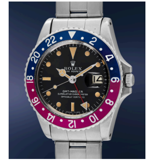
25 Rolex A very fine and well-preserved s... Estimate $12,000 — 24,000