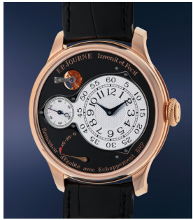
140 E.P. Journe An extremely rare, technically i... Estimate $70,000 — 140,000

New York Auction / 10 December 2022 / 10am EST