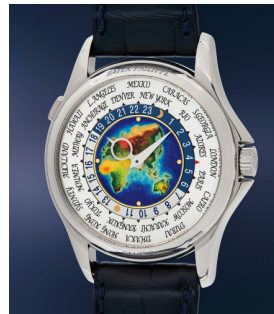
37 Patek Philippe A fine and attractive white gold ... Estimate $70,000 — 140,000