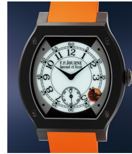
103 F.P. Journe An innovative and attractive ele... Estimate $12,000 — 24,000