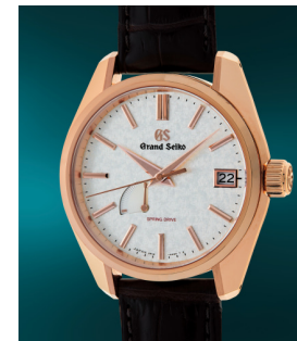
98 Grand Seiko A very fine and attractive limite... Estimate $15,000 — 30,000