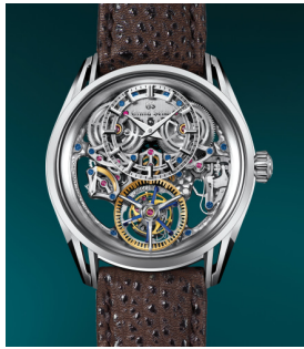
100 Grand Seiko A unique, historically important,... Estimate Estimate On Request

New York Auction / 10 December 2022 / 10am EST