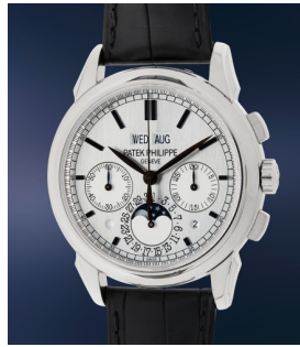
142 Patek Philippe An early and well-preserved whi... Estimate $70,000 — 140,000