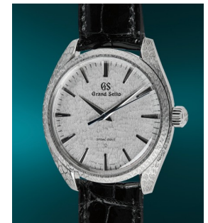
99 Grand Seiko An extremely fine, very rare, an... Estimate $40,000 — 80,000