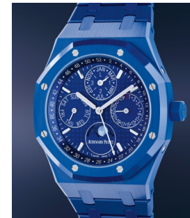
88A Audemars Piguet A special order, brand new, and ... Estimate Estimate On Request