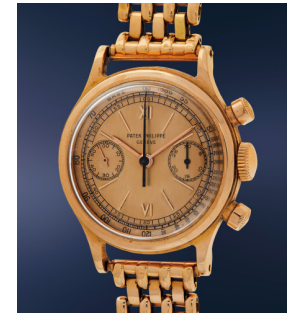
154 Patek Philippe An extremely rare and highly att... Estimate $150,000 — 300,000