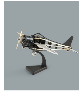
24 L'Epée A unique palladium, brass, and ... Estimate $20,000 — 40,000