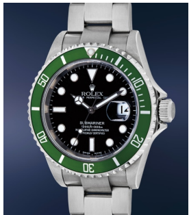
165 Rolex A rare, well-preserved and attra... Estimate $12,000 — 24,000