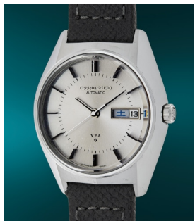
95 Grand Seiko A very precise and rare stainless... Estimate $10,000 — 20,000