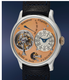
48 F.P. Journe A very early, highly important, a... Estimate $300,000 — 600,000