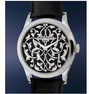
159 Patek Philippe A highly limited and sublime pla... Estimate $70,000 — 140,000