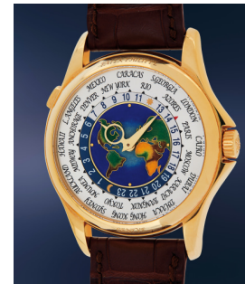
39 Patek Philippe A very fine and rare yellow gold ... Estimate $60,000 — 120,000