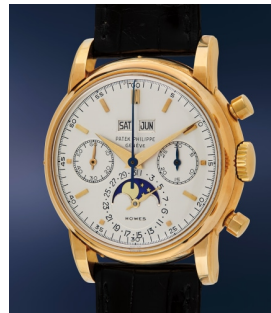
127 Patek Philippe A possibly unique, extremely ele... Estimate $400,000 — 800,000