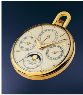
51 Patek Philippe A possibly unique, very rare, an... Estimate $25,000 — 50,000

New York Auction / 10 December 2022 / 10am EST