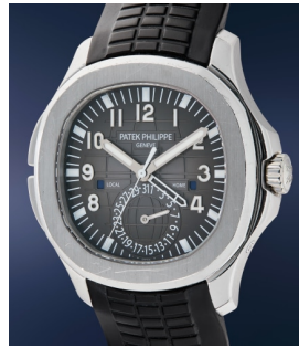
3 Patek Philippe A fine and attractive stainless st... Estimate $18,000 — 36,000