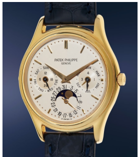
6 Patek Philippe A fine and attractive yellow gold... Estimate $20,000 — 40,000