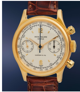
53 Patek Philippe An exceptionally rare and highly... Estimate $120,000 — 240,000