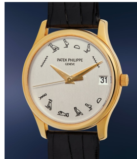
18 Patek Philippe A unique, extremely rare, cultur... Estimate $50,000 — 100,000