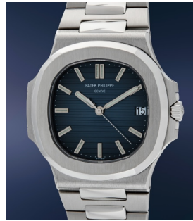
156 Patek Philippe A rare, first series, stainless stee... Estimate $40,000 — 80,000