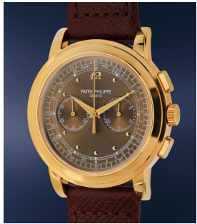
56 Patek Philippe A possibly unique and importan... Estimate $80,000 — 200,000