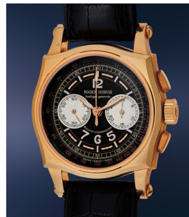
106 Roger Dubuis A quirky, innovative, and excitin... Estimate $15,000 — 30,000