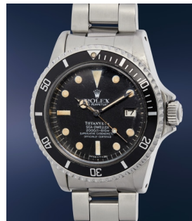
28 Rolex A very rare and fine stainless ste... Estimate $18,000 — 36,000