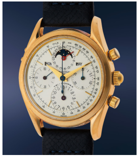
71 Universal A fine and attractive yellow gold... Estimate $3,000 — 6,000

New York Auction / 10 December 2022 / 10am EST