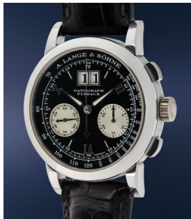
36 A. Lange & Söhne An early, attractive, and rare pla... Estimate $30,000 — 60,000