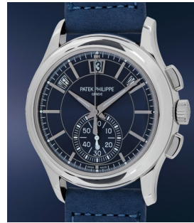
157 Patek Philippe A fine and attractive platinum a... Estimate $40,000 — 60,000