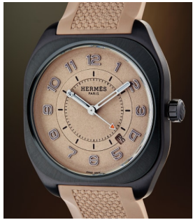
41 Hermes A limited edition DLC-coated tit... Estimate $5,000 — 10,000

New York Auction / 10 December 2022 / 10am EST