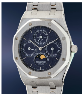
175 Audemars Piguet An elusive, resplendent, and ext... Estimate $100,000 — 200,000