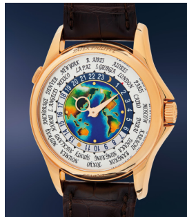
38 Patek Philippe A very rare and fine pink gold w... Estimate $70,000 — 140,000