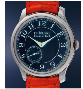
104 F.P. Journe A very fine and attractive tantal... Estimate $20,000 — 40,000