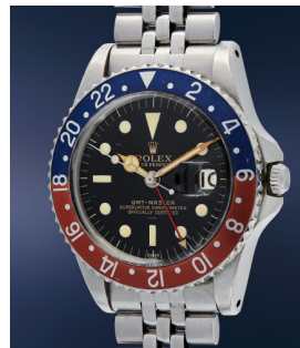
117 Rolex An extremely rare and well-pres... Estimate $30,000 — 60,000