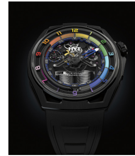
113 HYT A unique DLC-coated titanium fl... Estimate $50,000 — 100,000