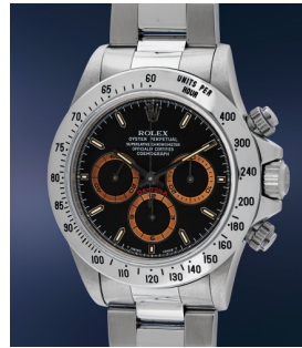
78 Rolex A rare and renowned stainless s... Estimate $40,000 — 80,000