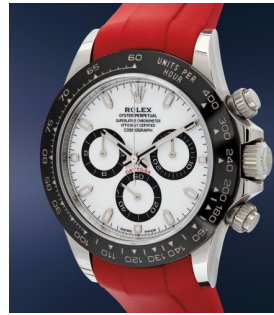
111 Rolex A fine and attractive stainless st... Estimate $8,000 — 16,000