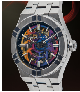
42 Maurice Lacroix A unique stainless steel wristwa... Estimate $3,000 — 6,000