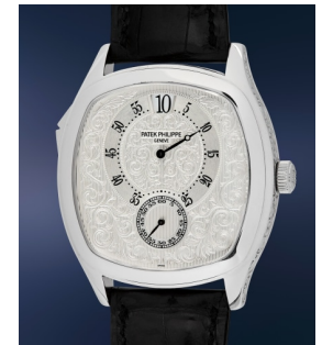
20 Patek Philippe An exceptional and rare limited ... Estimate $300,000 — 600,000