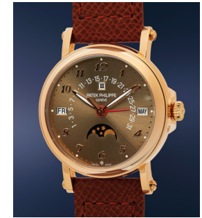
124 Patek Philippe A possibly unique and importan... Estimate $50,000 — 100,000