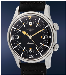
145 Longines An early and rare stainless steel ... Estimate $6,000 — 12,000