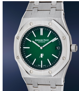
88 Audemars Piguet A brand new, highly coveted, an... Estimate $100,000 — 200,000