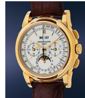
19 Patek Philippe A very fine and attractive yellow... Estimate $70,000 — 140,000