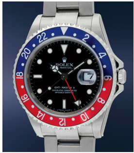
160 Rolex A rare, new old stock, and excep... Estimate $8,000 — 12,000

New York Auction / 10 December 2022 / 10am EST