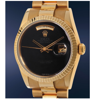
65 Rolex A rare and highly attractive yell... Estimate $15,000 — 25,000