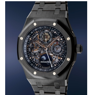
89 Audemars Piguet A brand new, extremely attracti... Estimate $150,000 — 300,000