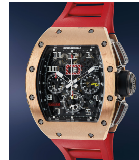
173 Richard Mille A rare and cutting edge pink gol... Estimate $150,000 — 300,000