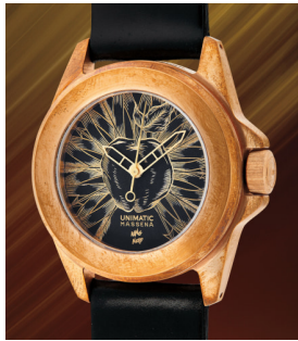
130 UNIMATIC X MASS... A unique bronze wristwatch wit... Estimate $6,000 — 12,000

New York Auction / 10 December 2022 / 10am EST