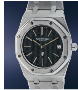
74 Audemars Piguet A highly rare and interesting sta... Estimate $40,000 — 80,000