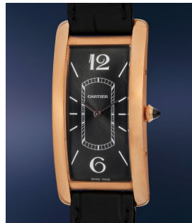
8 Cartier An elegant and desirable pink g... Estimate $15,000 — 30,000