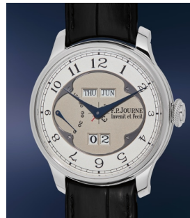
172 E.P. Journe An innovative and distinctive pl... Estimate $80,000 — 160,000