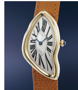
9 Cartier An extremely rare, historically i... Estimate $400,000 — 800,000