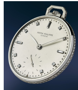
49 Patek Philippe A lovely, extremely rare, and su... Estimate $6,000 — 12,000