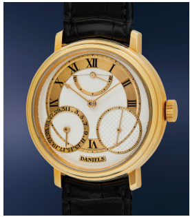
110 George Daniels An extremely rare, historically i... Estimate $400,000 — 1,000,000

New York Auction / 10 December 2022 / 10am EST