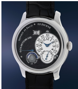
170 E.P. Journe An unusual, striking, and innova... Estimate $60,000 — 120,000

New York Auction / 10 December 2022 / 10am EST