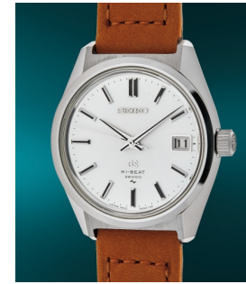
93 Grand Seiko A very rare, fine, and extremely ... Estimate $4,000 — 8,000