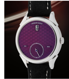
133 Andersen Geneve A unique platinum jump hours ... Estimate $20,000 — 40,000