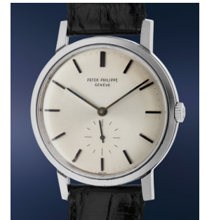
50 Patek Philippe A sporty and attractive stainless... Estimate $15,000 — 30,000