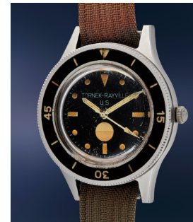
168 Tornek-Rayville An extensively documented, exc... Estimate $50,000 — 100,000