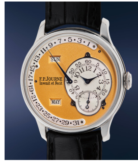
13 F.P. Journe An early, well-preserved, and at... Estimate $80,000 — 160,000