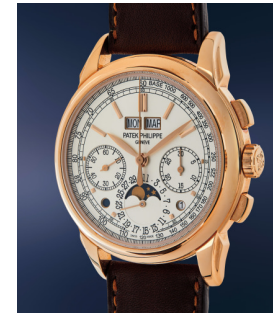
84 Patek Philippe An appealing and remarkable pi... Estimate $70,000 — 140,000