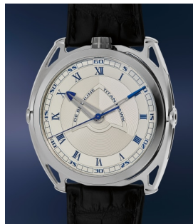
107 De Bethune An impressive, like new, and av... Estimate $25,000 — 50,000