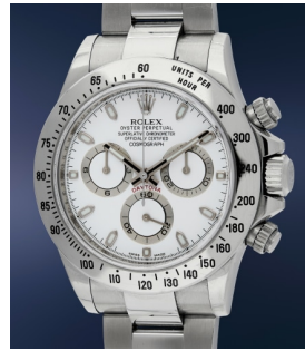
161 Rolex A very rare and highly attractive... Estimate $10,000 — 20,000