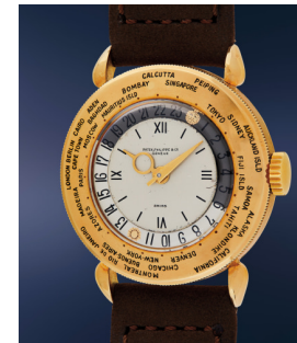
128 Patek Philippe An extremely early, historically i... Estimate $100,000 — 200,000