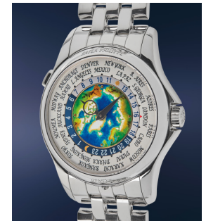
40 Patek Philippe An exceptional and very well-pr... Estimate $100,000 — 200,000