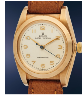
64 Rolex An exceptionally well-preserved... Estimate $8,000 — 16,000