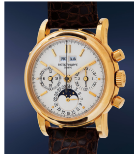
152 Patek Philippe A charming, elegant, and well-p... Estimate $50,000 — 100,000