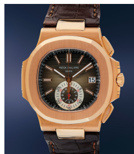
176 Patek Philippe A rare and highly attractive pink... Estimate $40,000 — 80,000