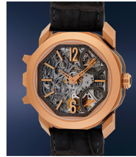
143 Bulgari A unique, exceptional, and impo... Estimate $80,000 — 160,000