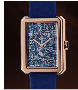
44 Chanel A limited edition beige gold rect... Estimate $30,000 — 60,000