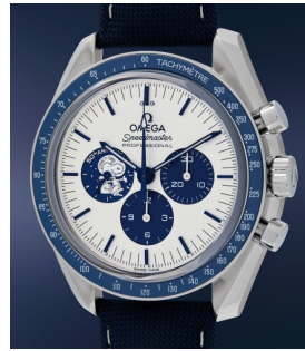
101 Omega A brand new stainless steel chro... Estimate $5,000 — 10,000