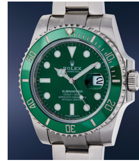
163 Rolex A verdant and highly coveted st... Estimate $8,000 — 16,000