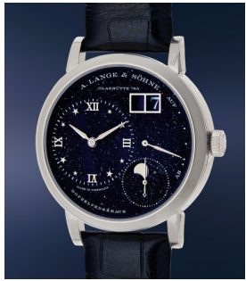
61 A. Lange & Söhne A fine and attractive white gold ... Estimate $25,000 — 50,000

New York Auction / 10 December 2022 / 10am EST