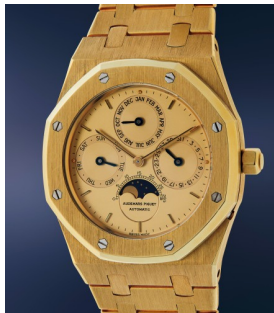
86 Audemars Piguet An extremely well-preserved, ea... Estimate $80,000 — 160,000