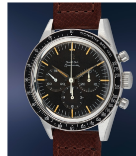
29 Omega An early, rare, and well-preserv... Estimate $20,000 — 40,000