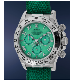
79 Rolex A rare, fine and highly attractive... Estimate $30,000 — 50,000