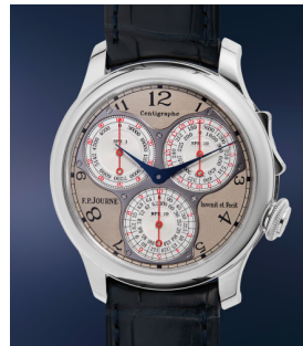
87 F.P. Journe A technically impressive platinu... Estimate $60,000 — 120,000