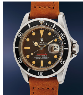
27 Rolex An early and fine stainless steel ... Estimate $15,000 — 30,000