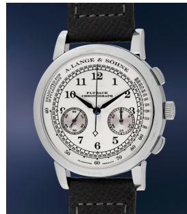
137 A. Lange & Söhne A refined and impressive white ... Estimate $30,000 — 60,000