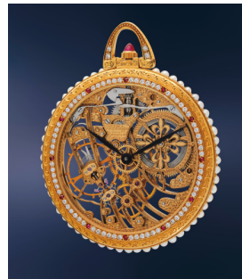
126 Patek Philippe One of six known, an ornate, fab... Estimate $60,000 — 120,000