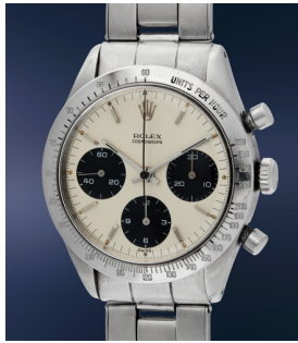
31 Rolex An extremely early and interesti... Estimate $30,000 — 60,000

New York Auction / 10 December 2022 / 10am EST