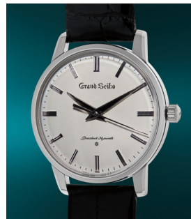
96 Grand Seiko A rare and highly attractive limi... Estimate $15,000 — 30,000