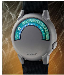
112 Urwerk A unique titanium wristwatch wi... Estimate $40,000 — 80,000