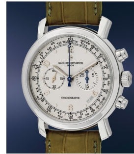
59 Vacheron Constantin A rare, large, and attractive plat... Estimate $18,000 — 36,000