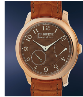
34 F.P. Journe A fine and attractive pink gold c... Estimate $20,000 — 40,000