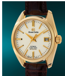
97 Grand Seiko A very fine and attractive limite... Estimate $15,000 — 30,000