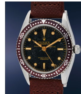
118 Rolex An extraordinarily rare, historic... Estimate $30,000 — 50,000