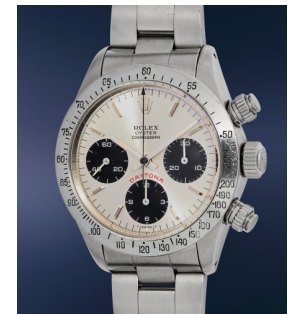
119 Rolex An attractive and well-preserve... Estimate $50,000 — 100,000