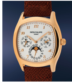
12 Patek Philippe A fine and attractive pink gold c... Estimate $25,000 — 50,000