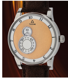
22 Trilobe A limited edition stainless steel ... Estimate $6,000 — 12,000