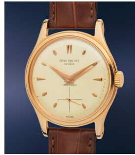
151 Patek Philippe A possibly unique, exceptionally... Estimate $20,000 — 40,000