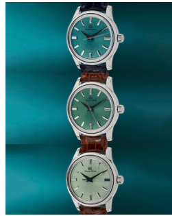
91 Grand Seiko A set of three very fine and attra... Estimate $8,000 — 16,000