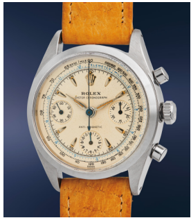
66 Rolex A striking and highly rare stainle... Estimate $30,000 — 60,000