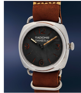
148 Panerai An exceptionally rare and histori... Estimate $20,000 — 40,000