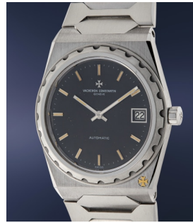
73 Vacheron Constantin A very rare and fine stainless ste... Estimate $30,000 — 60,000