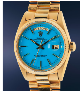
67 Rolex A very rare and highly attractive... Estimate $40,000 — 80,000