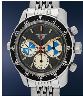
146 Heuer A rare and attractive stainless s... Estimate $8,000 — 16,000