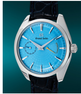
92 Grand Seiko A brand new and unworn limite... Estimate $4,000 — 8,000