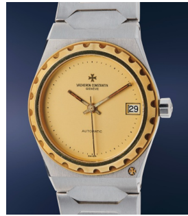
72 Vacheron Constantin A very rare and well-preserved s... Estimate $10,000 — 20,000