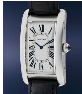
7 Cartier A fine and attractive oversized p... Estimate $4,000 — 8,000