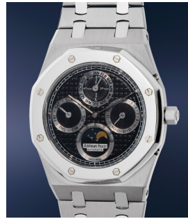
63 Audemars Piguet A rare and attractive stainless s... Estimate $80,000 — 160,000