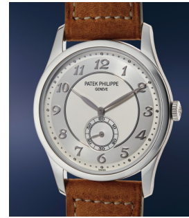
54 Patek Philippe A highly attractive and elegant ... Estimate $20,000 — 40,000