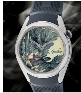
23 Romain Gauthier A unique platinum wristwatch w... Estimate $100,000 — 200,000