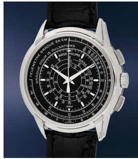
52 Patek Philippe A very rare and extremely fine li... Estimate $70,000 — 140,000