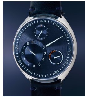
32 Ressence An unusual and avant-garde tit... Estimate $8,000 — 16,000