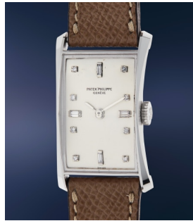
57 Patek Philippe A fresh-to-the-market, extreme... Estimate $20,000 — 40,000