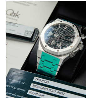
174 Audemars Piguet A highly attractive, brand new s... Estimate $60,000 — 120,000