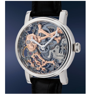
80 Kudoke A culturally interesting stainless... Estimate $6,000 — 12,000