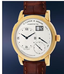
136 A. Lange & Söhne An early, attractive, and extrem... Estimate $30,000 — 60,000