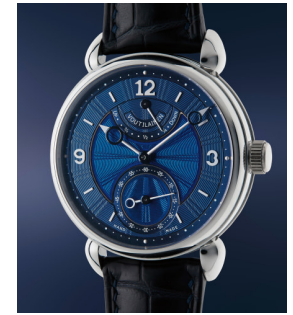
15 Voutilainen A possibly unique, vibrant, and i... Estimate $70,000 — 140,000