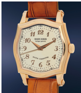
105 Roger Dubuis A fine and attractive pink gold w... Estimate $10,000 — 20,000