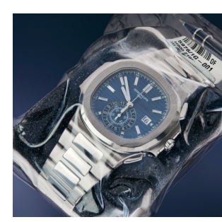
178 Patek Philippe A massive, very rare, and highly ... Estimate $150,000 — 300,000