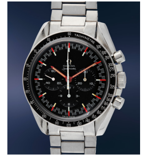
149 Omega An extremely rare and compelli... Estimate $30,000 — 60,000