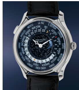
17 Patek Philippe A rare and attractive limited edi... Estimate $50,000 — 100,000