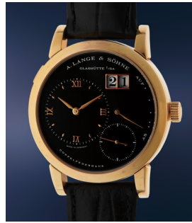
33 A. Lange & Söhne A rare and attractive pink gold ... Estimate $15,000 — 25,000