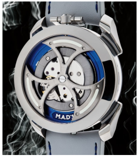
21 M.A.D. Editions A limited edition stainless steel ... Estimate $1,000 — 2,000

New York Auction / 10 December 2022 / 10am EST