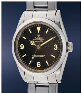
26 Rolex An early and attractive stainless... Estimate $15,000 — 30,000