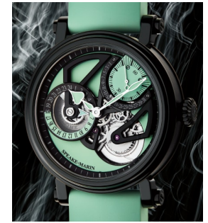
114 Speake-Marin A prototype dual time zone DLC... Estimate $10,000 — 20,000