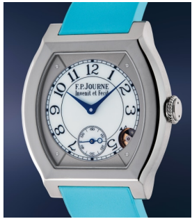
1 E.P. Journe A coveted and attractive titaniu... Estimate $10,000 — 20,000