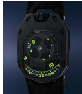
82 Urwerk An unusual and compelling limit... Estimate $25,000 — 50,000