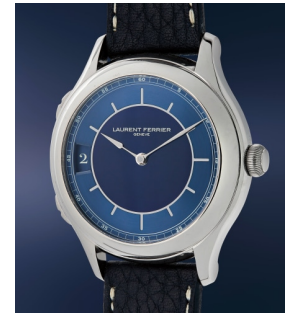
45 Laurent Ferrier An attractive and appealing tita... Estimate $20,000 — 40,000