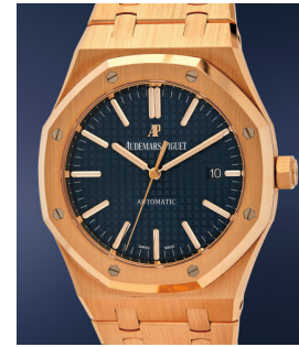
4 Audemars Piguet An exceptional and attractive pi... Estimate $30,000 — 60,000