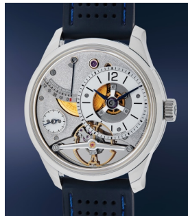
47 Greubel Forsey An exceptional limited edition w... Estimate $80,000 — 160,000