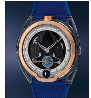
85 De Bethune A fine and attractive pink gold a... Estimate $40,000 — 80,000