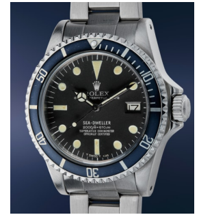
164 Rolex A rare and attractive stainless s... Estimate $12,000 — 20,000