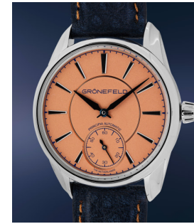
14 Grönefeld A very fine and attractive stainl... Estimate $20,000 — 40,000