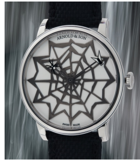
131 Arnold & Son A unique stainless steel wristwa... Estimate $8,000 — 16,000