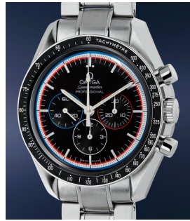
102 Omega A “new old stock” and interestin... Estimate $5,000 — 10,000