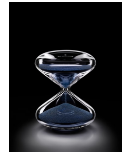
129 HG Timepiece x De B... De Bethune and HG Timepiece u... Estimate $12,000 — 24,000