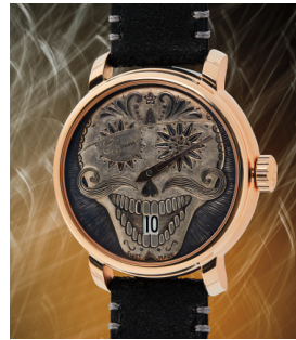
132 Chopard A unique pink gold jump hour wr... Estimate $60,000 — 120,000