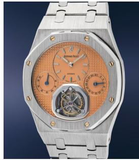
141 Audemars Piguet A striking and well-preserved li... Estimate $60,000 — 120,000