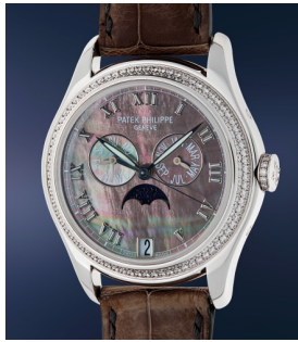
11 Patek Philippe A fine and attractive white gold ... Estimate $15,000 — 30,000

New York Auction / 10 December 2022 / 10am EST