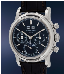
16 Patek Philippe An extraordinarily rare, elegant,... Estimate $70,000 — 140,000