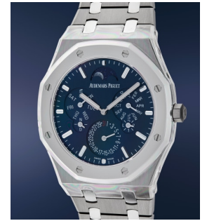
144 Audemars Piguet A brand new, elegant, and techn... Estimate $100,000 — 200,000