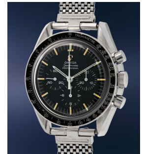
169 Omega A culturally and historically imp... Estimate $75,000 — 150,000