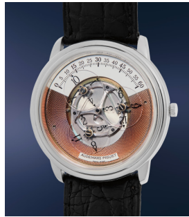
58 Audemars Piguet A very fine and attractive platin... Estimate $20,000 — 30,000