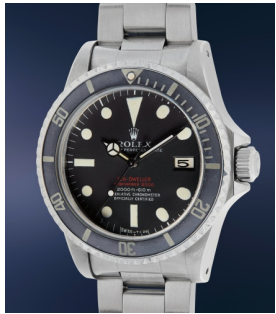
76 Rolex A rare and attractive stainless s... Estimate $20,000 — 40,000