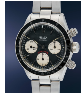
69 Rolex A well-preserved and highly attr... Estimate $40,000 — 80,000