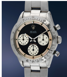
167 Rolex A rare and attractive stainless s... Estimate $70,000 — 140,000