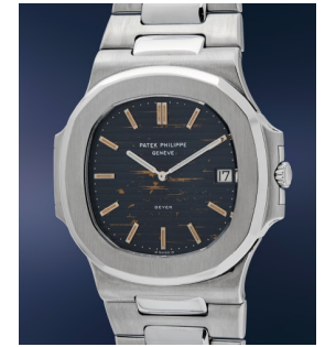
75 Patek Philippe A highly elusive, very attractive,... Estimate $100,000 — 200,000