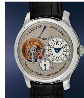
108 F.P. Journe An attractive and elegant platin... Estimate $120,000 — 240,000