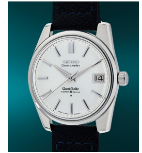
94 Grand Seiko A very fine and attractive stainl... Estimate $8,000 — 16,000