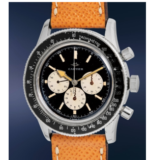
10 Cartier An exceptionally rare, interestin... Estimate $12,000 — 24,000