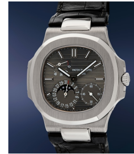
158 Patek Philippe A beautiful and sought-after wh... Estimate $40,000 — 80,000