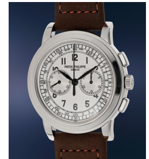
139 Patek Philippe An exceptionally well-preserved... Estimate $40,000 — 60,000