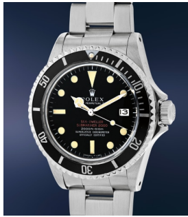
150 Rolex A very rare, early, and well pres... Estimate $70,000 — 140,000

New York Auction / 10 December 2022 / 10am EST