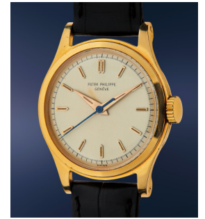
55 Patek Philippe A crisp and attractive yellow gol... Estimate $20,000 — 40,000