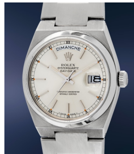
116 Rolex An extraordinarily rare and well... Estimate $12,000 — 24,000