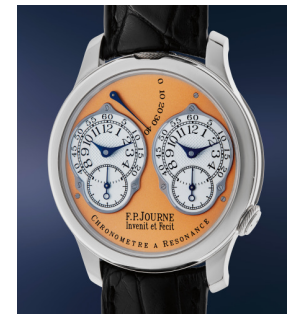
109 F.P. Journe A rare and impressive platinum ... Estimate $150,000 — 300,000