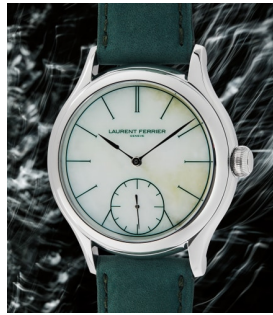
43 Laurent Ferrier A unique stainless steel wristwa... Estimate $30,000 — 60,000