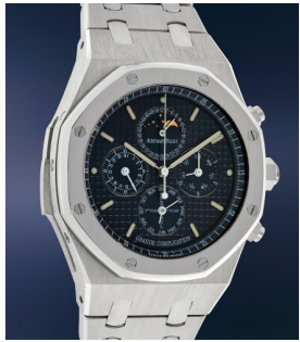
90 Audemars Piguet A very rare and impressive whit... Estimate $250,000 — 500,000

New York Auction / 10 December 2022 / 10am EST