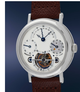
138 Breguet A remarkable and well-preserve... Estimate $30,000 — 60,000