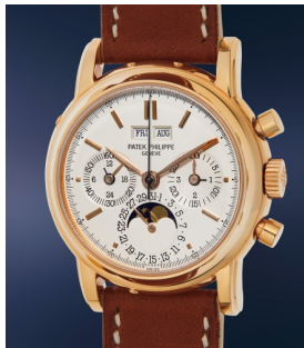
125 Patek Philippe An extremely rare, incredibly we... Estimate $80,000 — 160,000