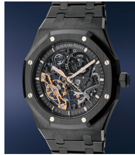
62 Audemars Piguet A brand new, extremely attracti... Estimate $150,000 — 300,000