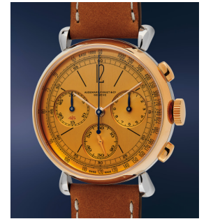
60 Audemars Piguet A very attractive and rare limite... Estimate $20,000 — 40,000