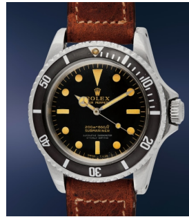
77 Rolex A very well-preserved and prete... Estimate $25,000 — 50,000