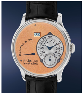
46 F.P. Journe An extremely rare, early, and hi... Estimate $60,000 — 120,000