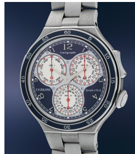
171 E.P. Journe An impressive, luxurious, and co... Estimate $60,000 — 120,000