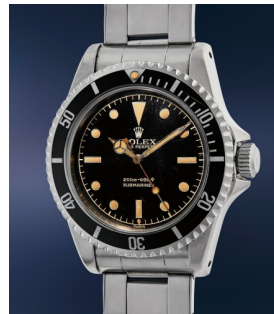
166 Rolex An attractive and compelling st... Estimate $20,000 — 40,000