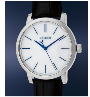
35 Credor A beautiful and sublime platinu... Estimate $25,000 — 50,000