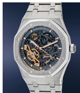
177 Audemars Piguet A brand new, strikingly attractiv... Estimate $70,000 — 140,000