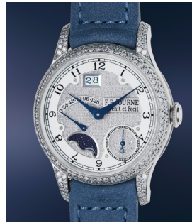
83 F.P. Journe A fine and attractive platinum a... Estimate $60,000 — 120,000