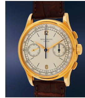
153 Patek Philippe A very rare, large, and attractiv... Estimate $120,000 — 240,000