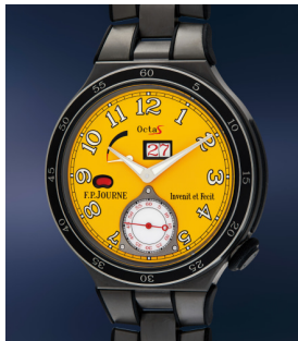
135 F.P. Journe A fine and attractive titanium w... Estimate $30,000 — 60,000