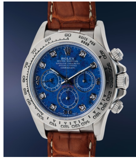
162 Rolex A rare and highly attractive whit... Estimate $20,000 — 40,000