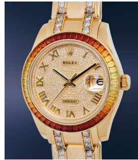
68 Rolex A dazzling, exceptional, and wel... Estimate $50,000 — 100,000