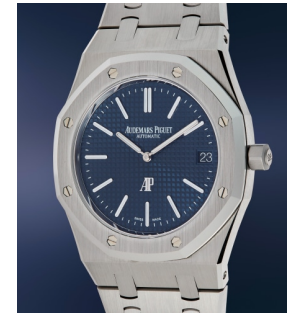
5 Audemars Piguet A highly attractive, brand new s... Estimate $40,000 — 80,000