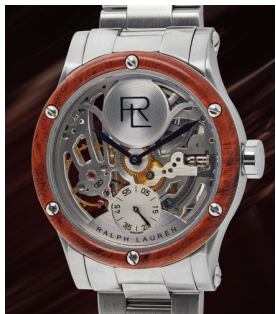
115 Ralph Lauren An interesting stainless steel sk... Estimate $20,000 — 40,000