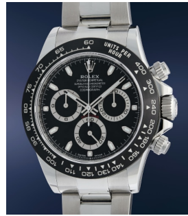
2 Rolex A brand new and highly attracti... Estimate $12,000 — 24,000