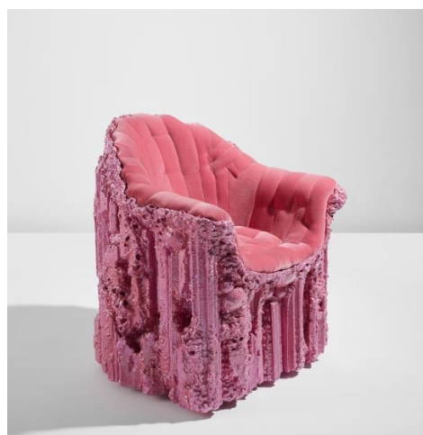
Chris Schanck "Puff & Stuff" armchair, 2017 Estimate: $15,000 - 20,000