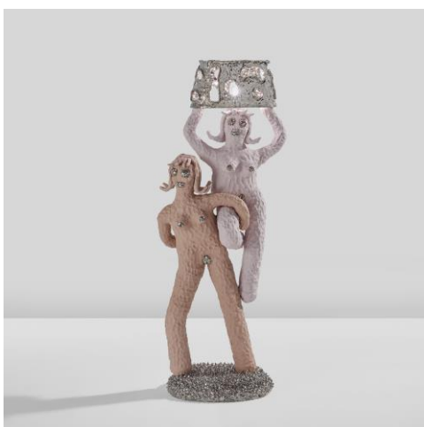
Katie Stout Unique "Double Girl" floor lamp, 2018 Estimate: $30,000 - 50,000