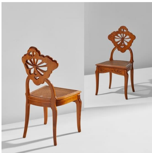
Émile Gallé Pair of "Ombelle" side chairs , circa 1902 Estimate: $12,000 - 18,000