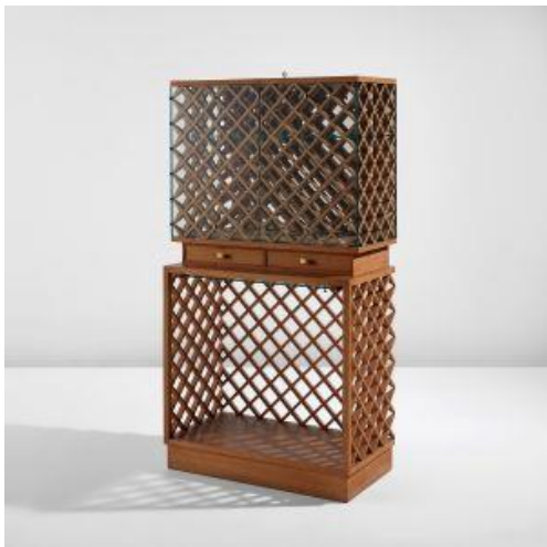
Pietro Chiesa Rare vitrine with integrated glass tray, from the VII Triennale, Milan, Italy, circa 1939 Estimate: $50,000 - 70,000