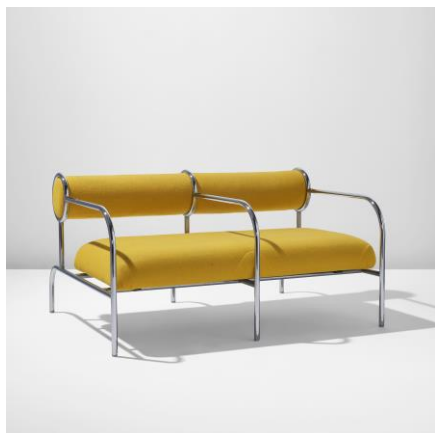
Shiro Kuramata Rare "Sofa with Arms (double)," circa 1982 Estimate: $25,00 - 35,000