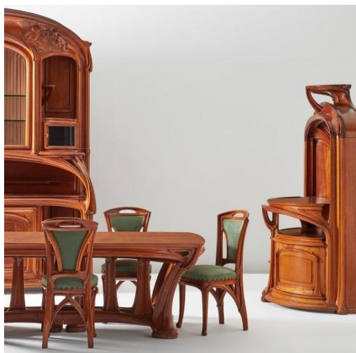
Eugène Vallin Important dining suite , circa 1905 Estimate: $100,000 - 150,000