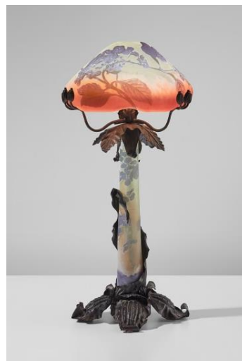
Émile Gallé "Hortensia" table lamp , circa 1904 Estimate: $20,000 - 30,000