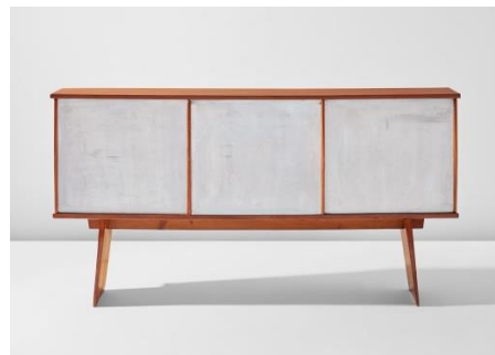
Charlotte Perriand and Pierre Jeanneret Sideboard, model no. 4 , designed 1939-1945, manufactured 1946-1968 Estimate: $100,000 - 150,000