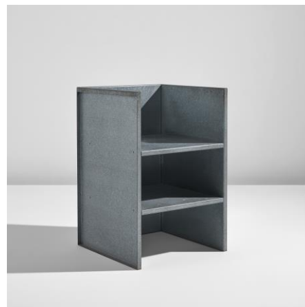
Donald Judd Rare "Armchair 1," designed 1984, produced 1993 Estimate: $40,000 — 60,000