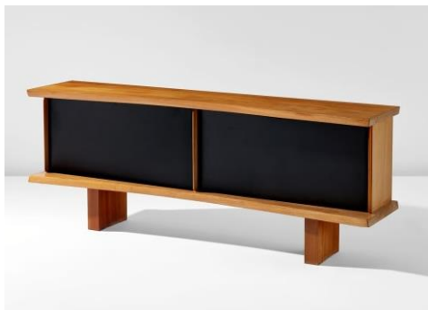
Charlotte Perriand "En Forme" sideboard , circa 1964 Estimate: $300,000 - 400,000

This curated, single-owner section also features outstanding contemporary and Latin American designs. Additionally, modern and contemporary artworks from the same collection will be showcased in Phillips' December Modern & Contemporary Art online auction, running from December 2–12. These artworks will be on view at the 432 Park Avenue galleries during the Design pre-sale exhibition.