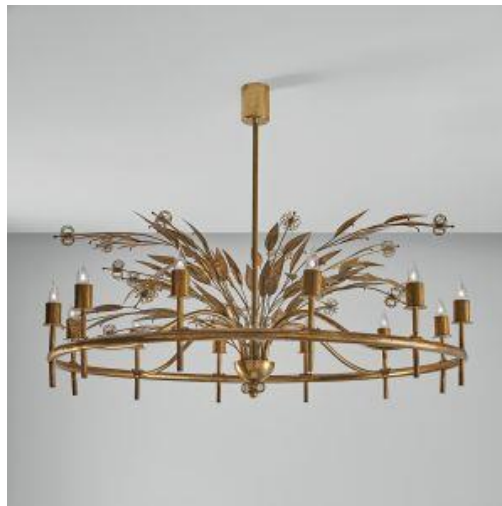
Paavo Tynell Twelve-arm ceiling light, circa 1950 Estimate: $40,000-60,000