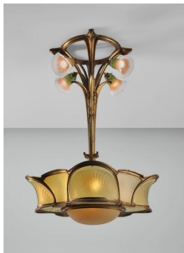
Eugène Vallin Important ceiling light , circa 1905 Estimate: $100,000 - 150,000

This suite exemplifies Vallin's visionary approach to furniture as living art, with flowing, organic forms inspired by local flora. Created during the height of Vallin's expressive period, the pieces reflect his unparalleled craftsmanship and the artistic ideals of France's Art Nouveau movement. This rare ensemble underscores Vallin's pivotal role in shaping the legacy of the École de Nancy.