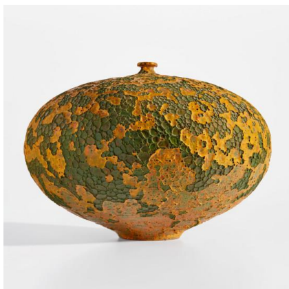
Doyle Lane Large weed pot, circa 1965 Estimate: $15,000 - 20,000