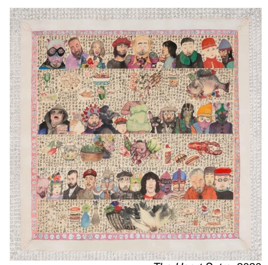
The Heart Sutra, 2020 ink and colour on paper image: 177 x 177 cm, sheet: 186 x 186 cm