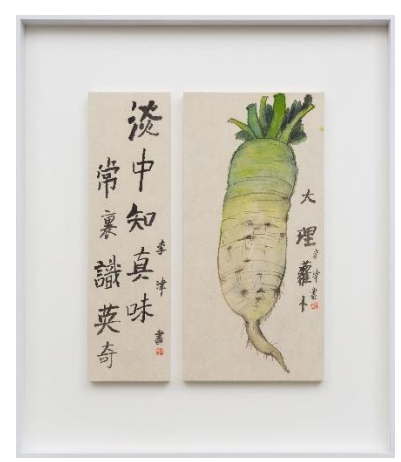
Knowing the Real Taste when it's Bland, 2024 ink and color on paper, in two parts 37 x 11 cm, 38 x 18cm