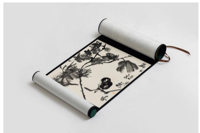
Chirping Birds, Fragrant Flowers, 2023 ink on paper, in two parts 24 x 33.5 cm, 33 x 33 cm

Not only are there vibrant women and feasts of wine and meat, but Li's paintings also depict everyday fruits and vegetables, all personally grown by him. His works capture the essence of ordinary life, sometimes full and passionate, other times lazy and leisurely. He combines his whimsical ideas, life insights, and exquisite skills, inviting viewers to appreciate his unique world and savor the beauty of life.