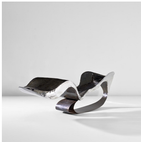
Ron Arad Unique 'Sapporo Spring' , 1990 Estimate: £25,000–35,000