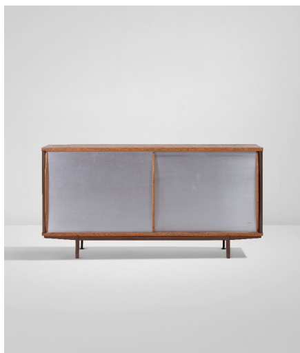
Jean Prouvé Cabinet, model no. 150 , circa 1955 Estimate: £80,000–120,000

Highlights of French mid-century design include Jean Prouvé's Cabinet, model no. 150 . Developed in the context of post-war scarcity and urgent housing needs, the design treats furniture as an extension of architecture. Its folded sheet-steel uprights act as load-bearing elements, while its demountable construction anticipates the rise of prefabrication and modular living. Charlotte Perriand's iconic 'Nuage' wall-mounted shelf further expands this architectural approach into the domestic sphere. Conceived as a flexible, open system, the design reflects her interest in adaptability and the integration of furniture within living space. Also on offer are five mirrors and a Rare sculpture by Line Vautrin, showcasing a variety of her intimate and avant-garde radiating compositions, defined by an inventive use of Talose and a distinctive interplay of light, reflection and poetic fantasy.