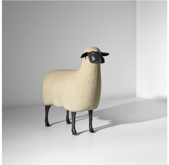
François-Xavier Lalanne 'Mouton de Pierre', designed 1979, executed 1989 Estimate: £180,000–250,000

LONDON – 20 APRIL 2026 – Phillips is proud to unveil highlights from its Design auction in London on 30 April. Anchored by François-Xavier Lalanne's iconic 'Mouton de Pierre' sheep and a distinguished group of French mid-century design, the sale brings together visionary objects that trace the evolution of design from post-war reconstruction to radical experimentation. From Ettore Sottsass, Jr.'s deeply personal and unique 'Toeletta Nanda' to exceptional works by Jean Prouvé and Charlotte Perriand, alongside pioneering collaborations between Gio Ponti and Piero Fornasetti and between Osvaldo Borsani and Lucio Fontana, the auction foregrounds design as both a reflection of its time and a catalyst for new ways of living. The catalogue is available online , with a public exhibition opening at Phillips' Berkeley Square galleries on 24 April.