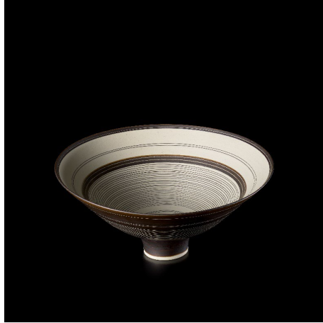
Lucie Rie Footed bowl, 1969 Estimate: £40,000–60,000