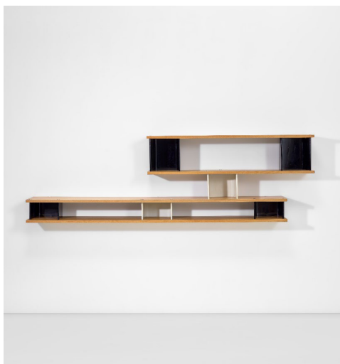
Charlotte Perriand 'Nuage' wall-mounted shelf , 1956 Estimate: £40,000–60,000