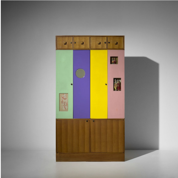
Ettore Sottsass, Jr. Unique 'Toeletta Nanda', from the Ettore Sottsass, Jr. and Fernanda Pivano residence, Milan, 1958 Estimate: £80,000–120,000