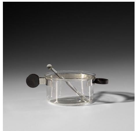
Josef Albers Rare tea glass with stirrer , circa 1925 Estimate: £15,000–20,000

Further highlights in the sale include a rare Tea glass with stirrer by Josef Albers, a refined example of Bauhaus design from the mid-1920s. Created within the Bauhaus metal workshop, the piece reflects the school's exploration of how everyday objects might be rethought through design. Rather than industrially produced, such works were experimental prototypes, and this is a rare surviving example from Albers' early practice. An example of this design is held in the permanent collection of The Museum of Modern Art, New York.