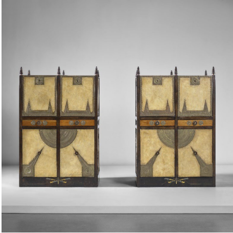
Carlo Bugatti Pair of cabinets, circa 1900 Estimate: £40,000–60,000