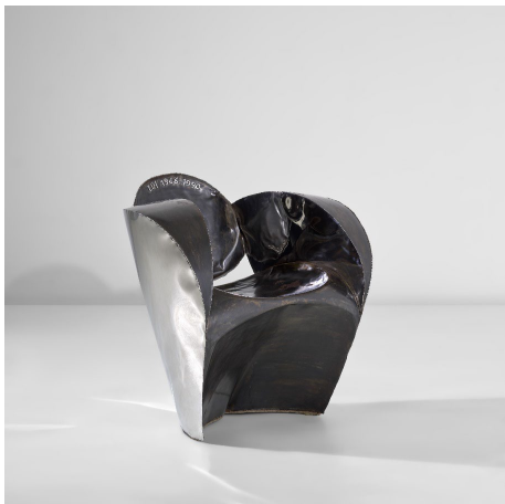
Ron Arad Unique armchair , circa 1990 Estimate: £25,000–35,000

Equally compelling are two early works by Ron Arad, created circa 1990 in his London studio, One Off. These unique chairs, executed for private clients, capture a moment of raw experimentation in which design was driven by process. With their exposed welds, visible joints and dynamic use of materials such as sprung steel, they embody Arad's groundbreaking approach to making. These works, rarely seen on the market, offer important insight into the formative years of one of the most influential designers of his generation. A further highlight is a rare 'Placebo' side table by Shiro Kuramata. Gifted to the current owner directly by the artist and produced with exceptional technical precision, the present example underscores Kuramata's enduring legacy as a master of poetic minimalism.