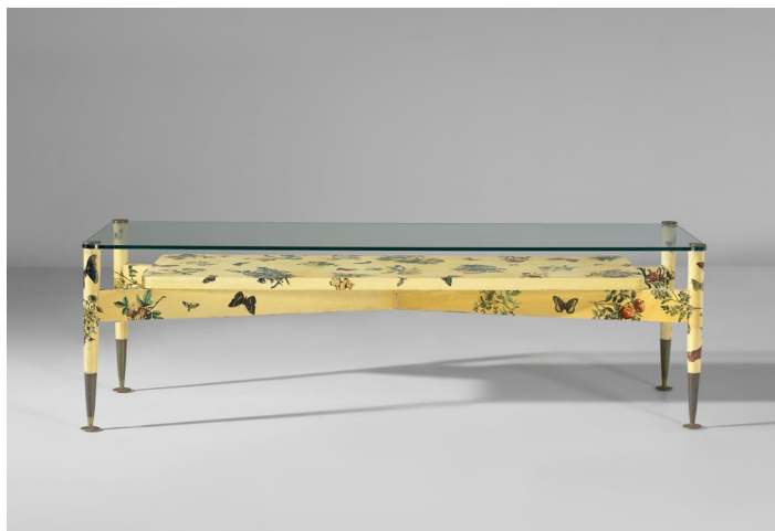
Gio Ponti and Piero Fornasetti Important 'Fiori e farfalle' low table , circa 1951 Estimate: £10,000–15,000

Equally emblematic of Italian post-war creativity is the Important 'Fiori e farfalle' low table by Gio Ponti and Piero Fornasetti, produced circa 1951 at the height of their collaboration. This partnership, rooted in a distinctly Milanese synthesis of art, design and architecture, reimagined the domestic interior as a total work of art. The present table reflects a moment when Ponti's concept of the casa attrezzata , the fully designed environment, was brought to life through Fornasetti's surreal and poetic visual language.