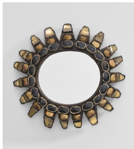
Line Vautrin Mirror , circa 1960 Estimate: £30,000–50,000