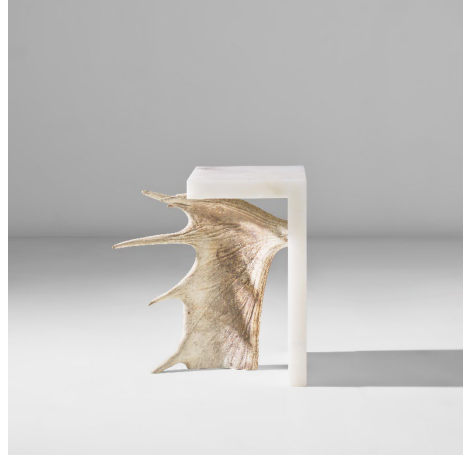
Rick Owens Rare 'Stag T', circa 2018 Estimate: £7,000–9,000