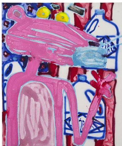
Katherine Bernhardt Lies , 2020 acrylic on canvas, 183 x 152 cm. Estimate: HK$200,000–300,000/ US$25,000-38,000 To be offered in Modern & Contemporary Art: Online Auction, Hong Kong 20 May- 3 June

Phillips is pleased to present a single-owner, no-reserve online sale featuring a focused selection of prints by Zao Wou-Ki. Spanning four decades from the 1950s through the 1990s, the offering traces the evolution of the artist's abstract language through a medium that is both versatile and deeply experimental. After settling in Paris in the late 1940s, Zao Wou-Ki immersed himself in the city's dynamic artistic milieu, where printmaking played a crucial role in shaping his practice. For the artist, it was not merely a means of refining gesture, but a true laboratory for exploring colour, rhythm, and space. Together, these works offer a compelling counterpoint to his paintings and works on paper, revealing the sustained energy, innovation, and expressive depth that defined his career.