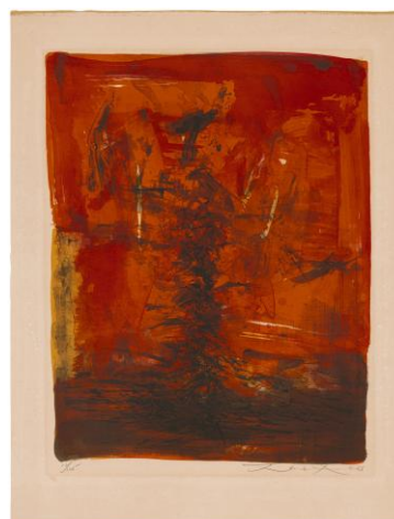
Zao Wou-Ki Sans titre , 1963 lithograph on paper, 65x50cm. Estimate: HK$30,000-50,000-US$3,800-6,400 To be offered in Modern & Contemporary Art: Online Auction, Hong Kong 29 May- 9 June