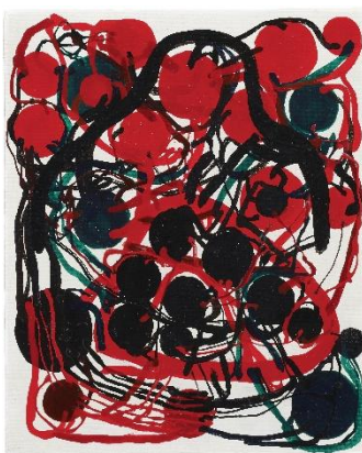
Atsuko Tanaka Untitled , 1986 synthetic polymer paint on canvas, 27.5 x 22 cm. Estimate: HK$260,000 - 350,000/ US$33,300 - 44,900