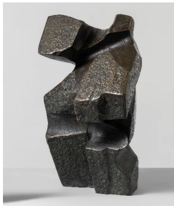
Ju Ming Taichi Series – Sparring , 1995 bronze, 46.5 x 28 x 29.5 cm. Estimate: HK$350,000 - 550,000/ US$44,900 - 70,500