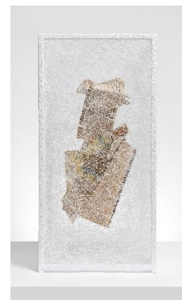
Chiharu Shiota State of Being (Map) , 2020 metal frame, maps and wire thread, 71 x 35 x 35.4 cm. Estimate: HK$380,000 - 580,000/ US$48,700 - 74,400

Another standout highlight of the sale is a signature sculpture from Ju Ming's renowned Taichi Series, in which the artist distills the philosophy and movement of Tai Chi into powerful, pared-down form, capturing stillness within motion. Also featured is Atsuko Tanaka's Untitled , created following her involvement with the Gutai movement. Translating the ephemeral energy of her Electric Dress performance into painting, the work's entangled circular forms and uneven lines evoke a dynamic tension between rhythm and instability.