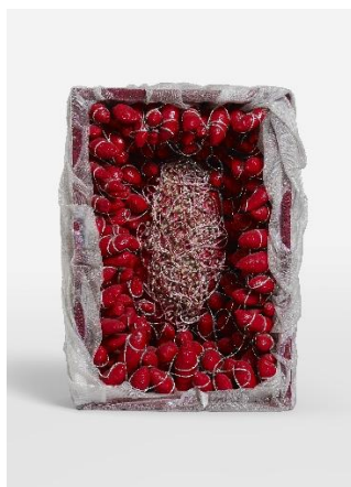
Yayoi Kusama Castle of Visionary Flowers , 1988 mixed media sculpture, 40 x 30 x 13.5 cm. Estimate: HK$350,000 - 650,000/ US$44,900 - 83,300