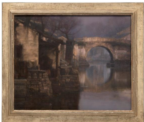
Chen Yifei Bridge Reflection (Suzhou) , 1987 oil on canvas, 87 x 106.8 cm. Estimate: HK$800,000 - 1,200,000/ US$103,000 - 154,000

The sale is led by Matthew Wong's The Recluse (illustrated page 1), a powerful work that distills the emotional depth and lyrical intensity emblematic of the artist's practice. The painting unfolds as a hushed, saturated landscape in which solitude is not merely suggested but profoundly felt. Thick passages of impasto surge from the flanking mountains toward a radiant sun, animating the surface with both physical and emotional charge. At the centre, a solitary figure stands as a poignant emblem of Wong's enduring exploration of the tension between inner life and the external world, between isolation and communion, introspection and vastness. Executed just one year before the artist's widely acclaimed solo debut at Karma Gallery in New York, The Recluse anticipates the clarity of vision and expressive confidence that would soon bring Wong international recognition.