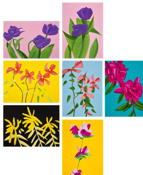
Alex Katz Flowers , 2021 Estimate: $50,000–70,000