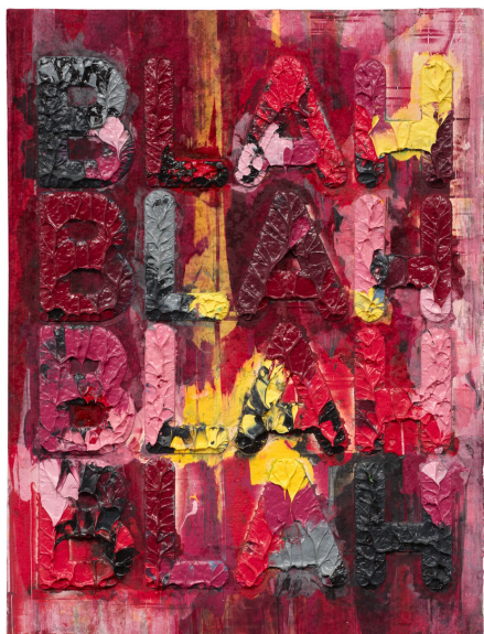
Mel Bochner Blah, Blah, Blah , 2019 Estimate: $20,000–30,000

Beyond the AMERICA 250 section, the sale features key examples of editioned practice across movements and decades. Additional highlights from the sale include Alex Katz's Flowers from 2021, the complete set of seven archival pigment prints in colors on Innova Etching Cotton Rag paper, as well as Gerhard Richter's Abstraktes Bild (1990/2014), Mel Bochner's Blah, Blah, Blah (2019), Andy Warhol's Mao (1972), KAWS' KAWSBOB suite (2011) and Alex Katz's Flowers . Additional works by Christopher Wool and Richard Hell, Jennifer Bartlett, Kenny Scharf, Ed Ruscha, Robert Motherwell, Rosemarie Trockel, and Dan Flavin further demonstrate the depth and versatility of the medium.