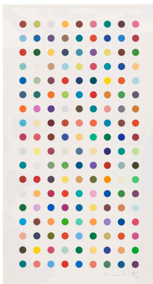
Damien Hirst Methamphetamine , 2004 Estimate: $20,000–30,000