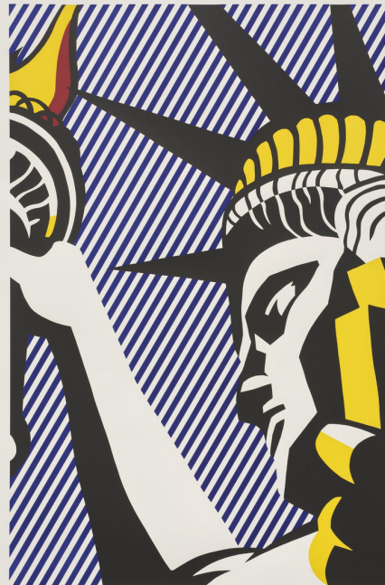
Roy Lichtenstein I Love Liberty , 1982 Estimate: $40,000–60,000

NEW YORK – 4 JUNE 2026 – Phillips is pleased to announce highlights from the Editions & Works on Paper Auction taking place on 24 June at 1:00 PM ET at 432 Park Avenue. Comprising more than 150 lots, the sale brings together a curated selection of works spanning the 20th and 21st centuries, from early avant-garde and Pop to Postwar and contemporary practices. Led by key figures such as Marcel Duchamp, Pablo Picasso, Andy Warhol, Roy Lichtenstein, and Robert Rauschenberg, the auction traces the evolution of printmaking as a medium of both experimentation and dissemination, presented alongside leading contemporary artists, including Damien Hirst, KAWS, Mickalene Thomas, Kehinde Wiley, and Kara Walker. A dedicated section of the sale, AMERICA 250 , assembles images that have shaped American identity and visual culture.