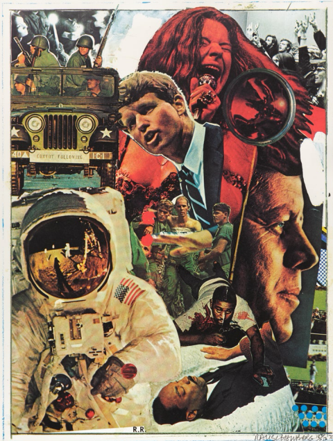
Robert Rauschenberg Signs , 1970 Estimate: $25,000–35,000

Auction to Also Spotlight Important Prints and Multiples by Damien Hirst, Alex Katz, Roy Lichtenstein, Mickalene Thomas, and Robert Rauschenberg, Among Others