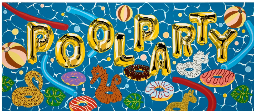
Joel Mesler Untitled (Pool Party) , 2025 Estimate: $10,000–15,000