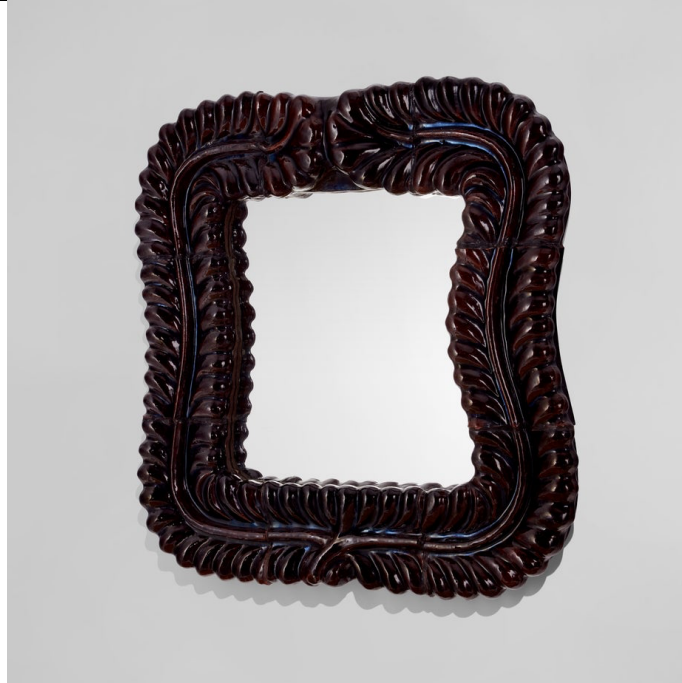
Georges Jouve Large mirror , circa 1946 Estimate: $50,000–70,000 Sold for $245,100