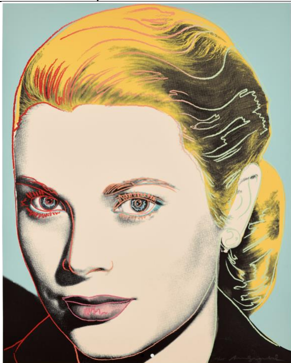
Andy Warhol Grace Kelly, 1984 Sold for $193,500