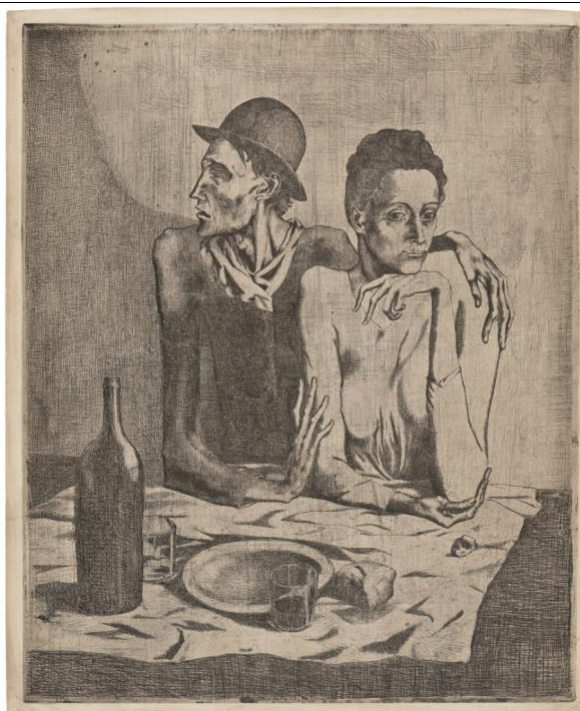
Pablo Picasso The Frugal Meal, plate 1 from La Suite des Saltimbanques, 1904 Sold for $141,900