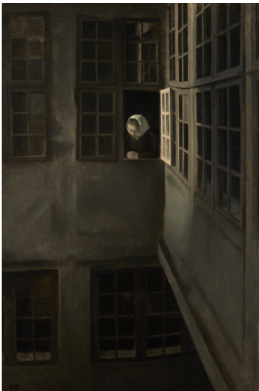
Vilhelm Hammershøi Courtyard Interior at Strandgade 30 , c. 1905 Estimate: $3,000,000-5,000,000

Collection of Ambassador John L. Loeb Jr. , the most important collection of Danish artwork in private hands, across the May Modern & Contemporary Art sales in New York. The collection made a commanding debut in London in early March, where the group collectively achieved twice its high estimate. Dynamic global participation underscored both the depth of the Loeb Collection and the growing international demand for Danish art. In all, Five Danish museums acquired six works across the auctions – including Ordrupgaard, SMK, The David Collection, Randers Kunstmuseum, and Ribe Kunstmuseum. Now, more than 100 works from the collection will be offered during the Modern & Contemporary Art auctions on 19 and 21 May, as well as in an online-only auction at the end of the month. Leading the group is Vilhelm Hammershøi's Courtyard Interior at Strandgade 30 , painted c. 1905, which balances the quietude of daily life with a staggering painterly Modernism. Combined with his expressive use of atmosphere and daringly simple palette, the work continues to captivate audiences with its modern aesthetic 120 years after its creation.