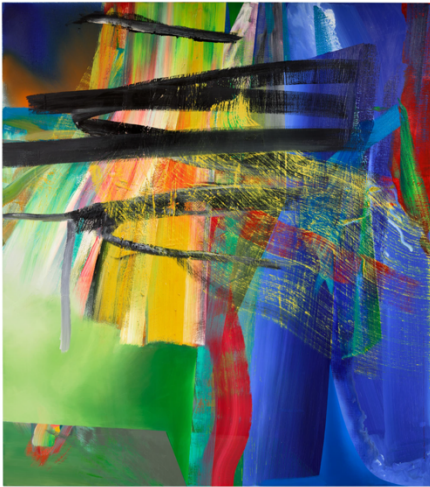
Gerhard Richter Besen , 1984 Estimate: $6,500,000-8,500,000

Painted in 1984, Besen emerges at a decisive juncture in Gerhard Richter's oeuvre, when his long-standing dialectic between photography and painting culminates in the expansive language of the Abstrakte Bilder . Executed at the height of the "Free Abstracts," the work, whose title means "broom," marks a shift toward a more immediate, gestural, and materially driven mode of abstraction. Oscillating between transparency and opacity, control and chance, Besen exemplifies Richter's balance between "composition and anti-composition," advancing a pictorial field that resists any fixed reading.