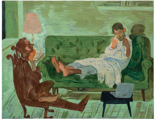
Salman Toor Two Friends , 2020 Estimate: $180,000-250,000

Painted in 2020, Two Friends belongs to the body of work that defined Salman Toor's breakthrough, fusing the visual language of European painting with