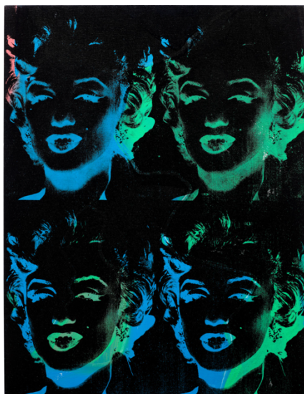
Andy Warhol 4 Colored Marilyns (Reversal Series) , 1979-1986 Estimate: $4,000,000-6,000,000

Painted in 1964, Sixteen Jackie's (illustrated on page 1) leads the Evening Sale. Standing as a vivid articulation of Andy Warhol's signature method of appropriation and multiplication, it transforms a single press photograph into a relentless visual refrain. Few figures are as inseparable from their image as Jacqueline Kennedy, and no artist was as attuned to that phenomenon as Warhol. The work presents her universally recognized visage in a format akin to a publicity headshot, positioning Jackie Kennedy as a purely allegorical, public symbol. A dignified and photogenic First Lady who quickly became an American icon, Jackie was celebrated for a personal style that