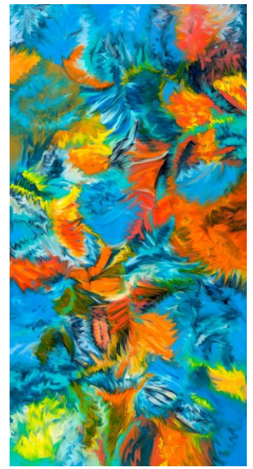
Sasha Ferré Averno, 2023 116 x 59 in.