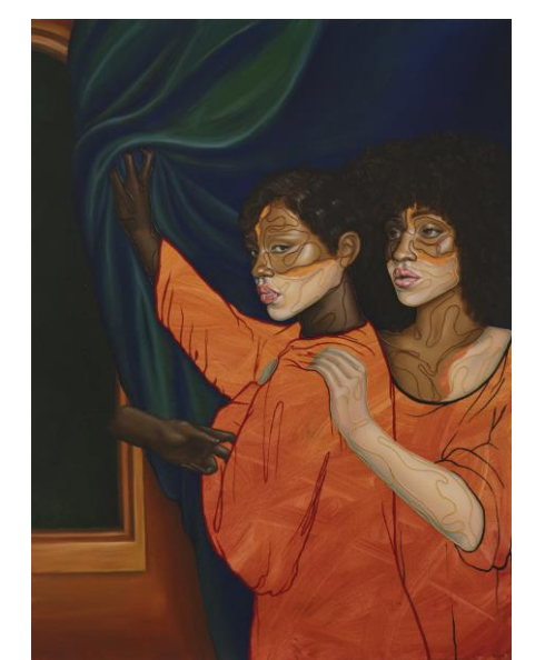
Rugiyatou Ylva Jallow The Stealing Of A Sacred Ember, 2024 48x 72 in.