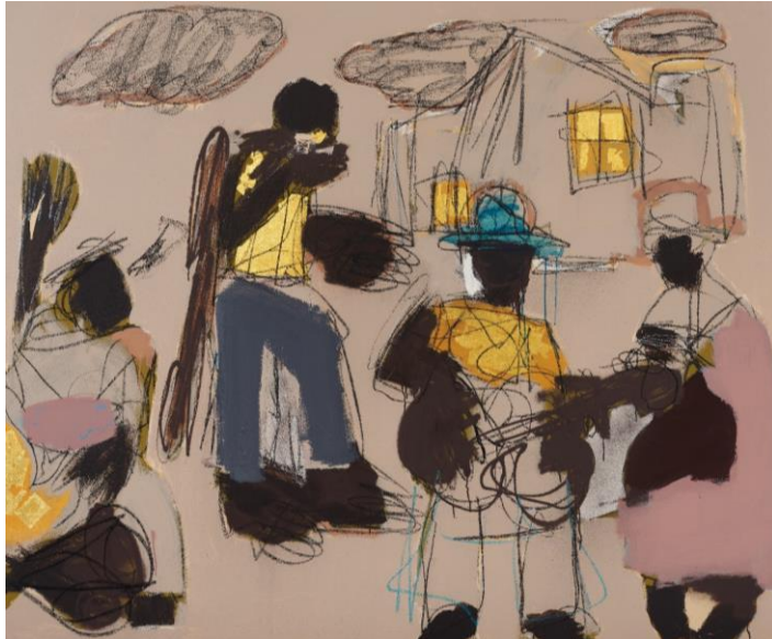
Ferrari Sheppard Swing Time, 2024 70 x 84 in.