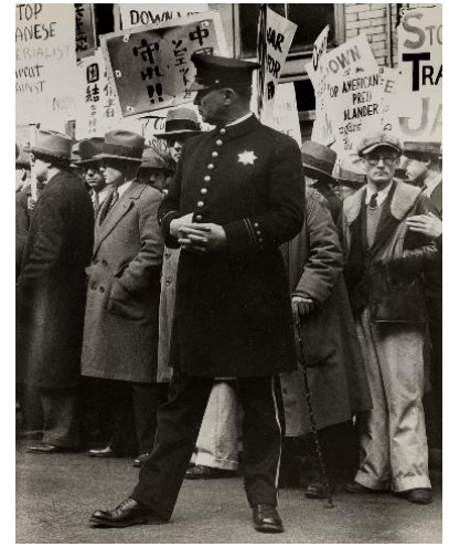
Street Demonstration, San Francisco, 1933 Estimate $8,000 - 12,000