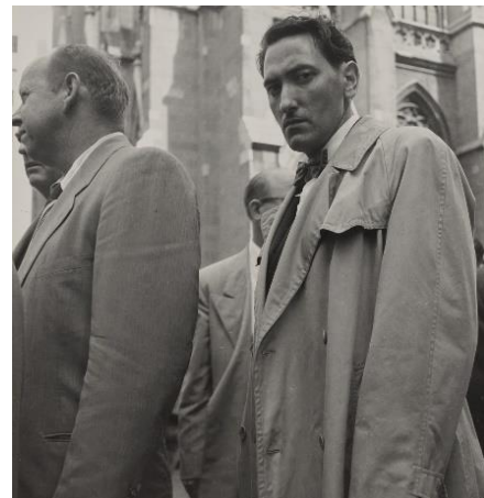
New York City (Man in Raincoat), 1952 Estimate $4,000 - 6,000