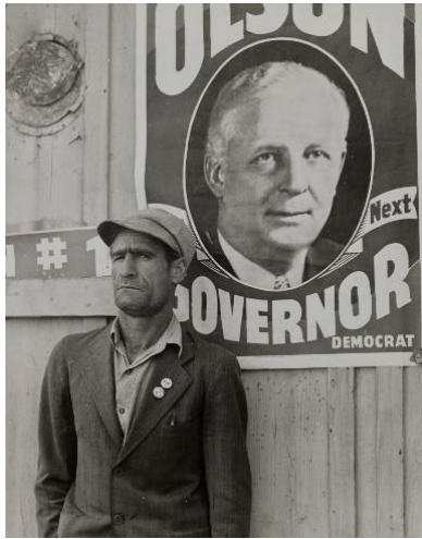
Kern County, California (Olson for Governor), 1938 Estimate $7,000 - 9,000