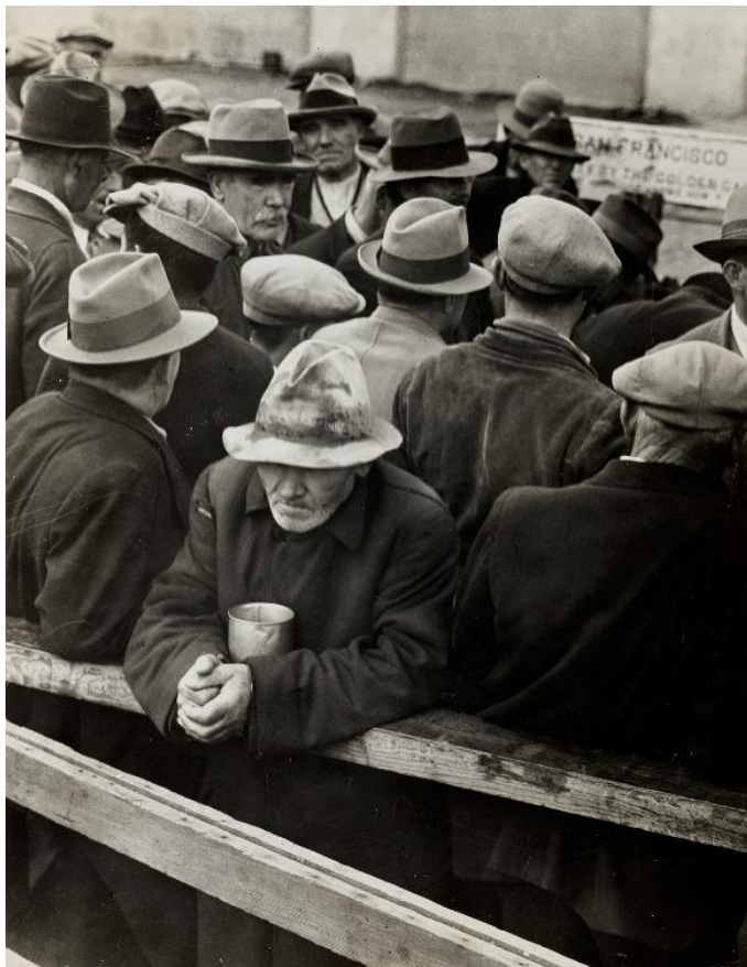
White Angel Breadline, San Francisco, 1933 Estimate: $20,000 - 30,000

Bidding Open from 3 to 13 October Alongside Public Exhibition at 432 Park Avenue