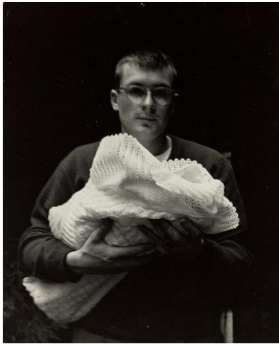
First Born, Berkeley, California, 1952 Estimate $5,000 - 7,000