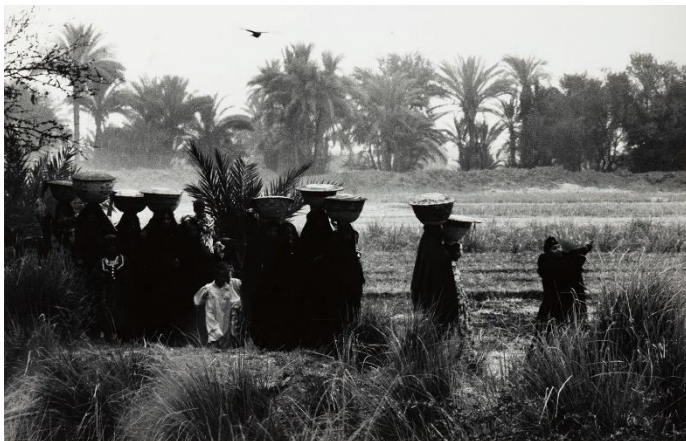
Procession Bearing Food for the Dead, Egypt, 1963 Estimate $3,000 - 5,000

During the Depression she traveled the country under the auspices of the Farm Security Administration, documenting the poverty endured by Americans and creating some of the most indelible and culturally relevant images of the 20 th century. She brought her incisive and empathetic documentary style to a variety of national and international subjects during and after World War II.