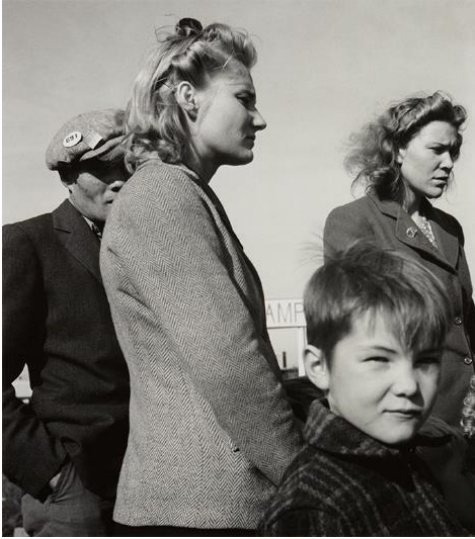
Shipyard Worker and Family in Trailer Camp, Richmond, California, 1944 Estimate $6,000 - 8,000

The two sales feature some of Lange's most indelible images from her multi-decade career in photography, as well as many images which will be new to collectors. All were in the photographer's collection at the time of her death, passed along to her descendants, and represent the entirety of her career, from the first socially-conscious images she made outside her portrait studio in San Francisco, through her work for the Farm Security Administration during the Depression, to her post-war documentary projects, much of it done in the company of her husband and collaborator Paul Taylor.